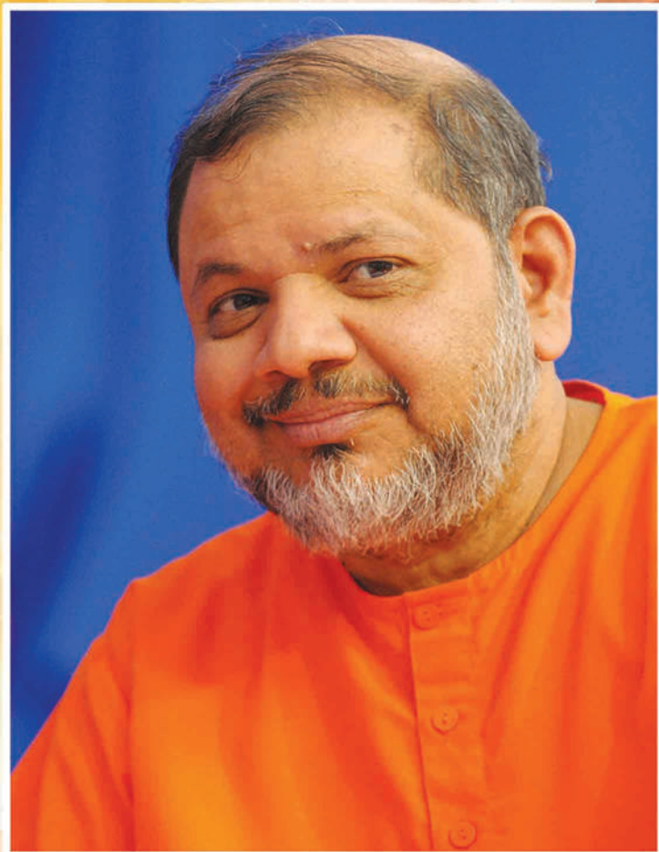
POOJYA GURUJI H.H. SWAMI THEJOMAYANANDA

“When a person works with inspiration, he never gets tired or exhausted”